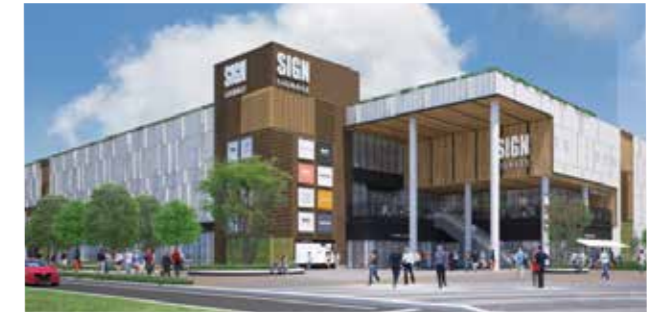
The commercial building (artist's rendition)

Renovation of the 21 residential buildings (medium-rise), used as the temporary accommodation facilities in the Olympic and Paralympic Village during the Games, and the commercial building is aimed for completion by fiscal 2023.