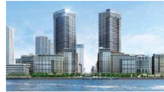
The cluster of buildings viewed from the ocean side (artist's rendition)

By placing the 2 residential buildings (high-rise), which will be the town's major features, on the inland side, the entire town will form a gentle silhouette, making the group of buildings appear pleasing to the eye.